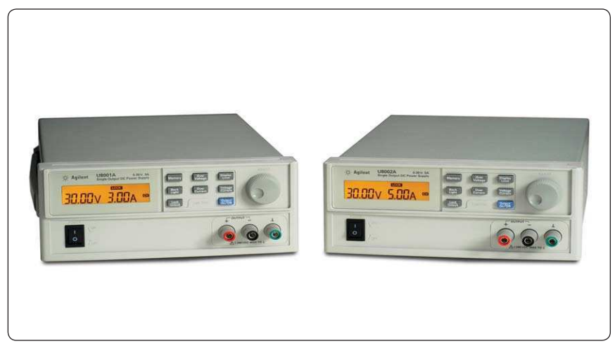
Figure 1. The U8001A 90 W and U8002A 150 W single output DC power supplies