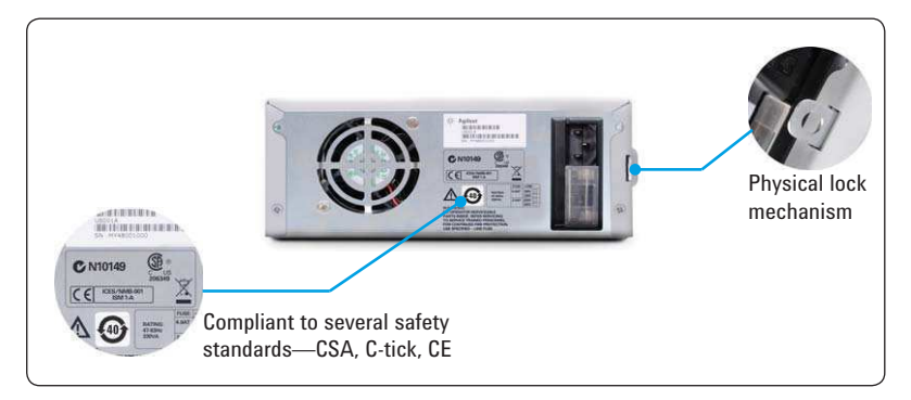
Figure 3. Safety and security features of the U8000 Series single output DC power supplies