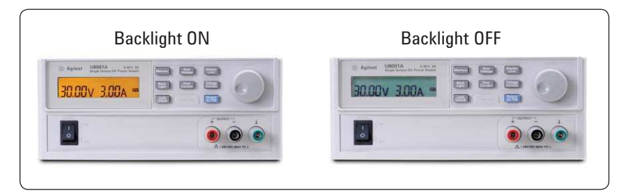
Figure 2. Backlight on/off options for LCD display